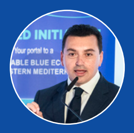
AARON FARRUGIA Minister for Transport, Infrastructure and Capital Projects of Malta (WestMED co-presidency)